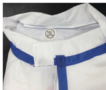
Visible Sizing Tag: Helps materials management teams identify size easily once suits removed from box.