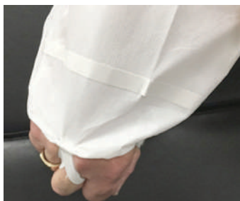
Thumb & Finger Loops Prevents sleeves from riding up.

Improves workers' safety and supports donning & doffing process.