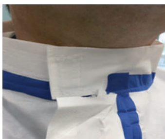
Mandarin Collar with Velcro Closure: Adjustable collar creates a better seal around the neck.