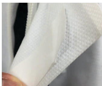
Zipper Front with Sealable Storm Flap has StarterTab for Tape: Easier for a gloved hand to pull and expose the tape for sealing storm flap.