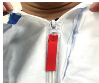
Large Zipper Pull with Red Fabric Pull Tab: Easier to see and use!