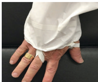
Double Sided Tape Around the Wrists: Helps keep gloves in place.